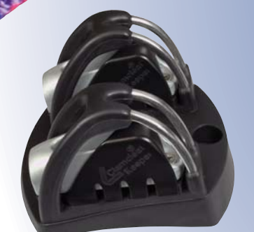
CL825CKC Silver CL825CKCAN Hard Anodised Two cleats pre-assembled onto a tapered

Keeper automatically keeps rope in or out of the cleat.