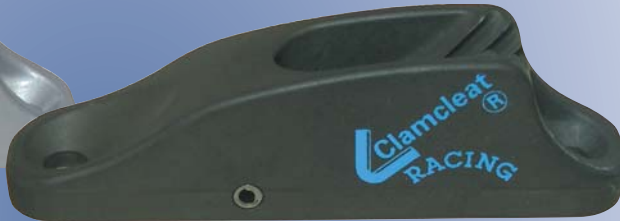
CL230AN (full size)

Rigged for Kitesurf brake line tensioning, and windsurfing harness.